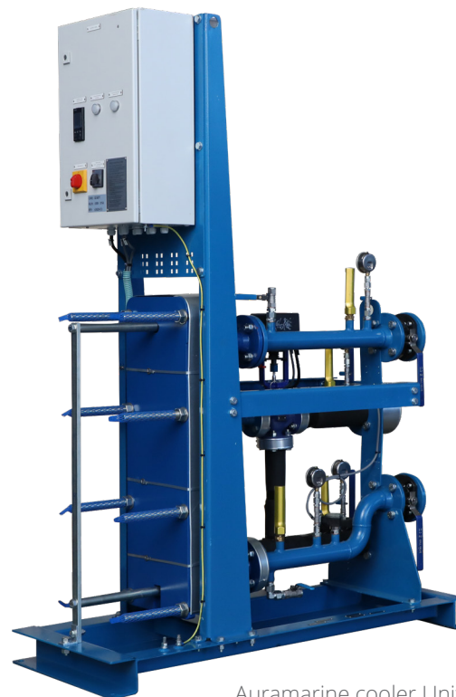
Auramarine cooler Unit (ACU)

Auramarine MGO units come in capacities equal to conventional Auramarine HFO boosters, power range 1-60 MW. Further capacities are available upon request.